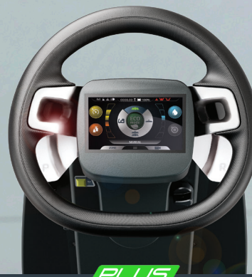
R36 - R30 - R28