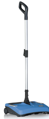
NS13 13" Sweeper HIL56000