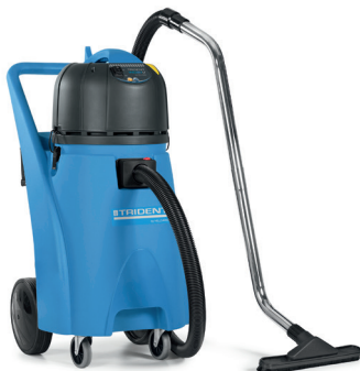
WD21V 21 Gallon Wet Dry Vac Cord Electric HIL56018