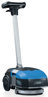
XM13SC 13" Disc w/ Parabolic Squeegee HIL56004