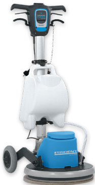
FMD20 Orbital 20" Orbital Floor Machine HIL56019