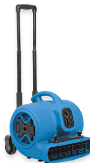
FD15 Floor Dryer Cord Electric HIL56015