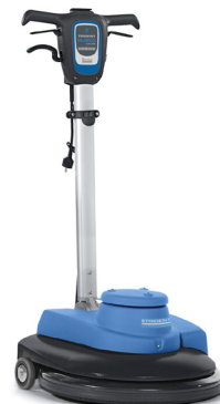
BU1500 1,500 RPM Burnisher HIL56022