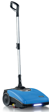
NM14 14" Cylindrical Scrubber HIL56001