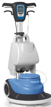
FMD20 20" Disc Floor Machine HIL56021